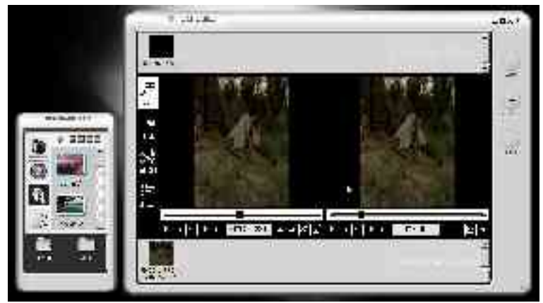
Illustration 5. The smaller control window can bring up any of four separate programs. Video editing is shown here as the second program.

The PVR-Plus CD and DVD burning program is functional, but weak on features. For instance, it does no auto-conversion, expecting only 1 type of file for each of the formats: DVD, SVCD, or VCD. You must record everything in the