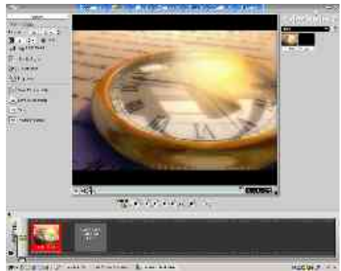
Illustration 3. Menu choices are on the left. To the right are all the clips you've browsed to or created. On the bottom is the sequence of clips that will become a single movie when you burn the disk.

I was disappointed that for short video material, I could not burn DVD quality